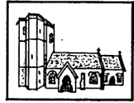
THE RECTORY, LITTON CHENEY