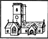
THE RECTORY, BURTON BRADSTOCK