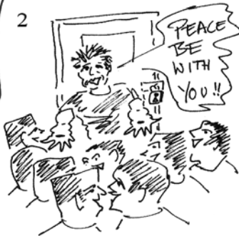
To their amazement Jesus appeared!