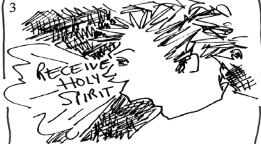
He breathed on them and said "Receive the Holy Spirit".