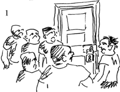
Jesus' followers hid inside

His followers locked themselves in – but Jesus appeared!