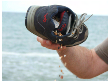
Under 16s: "A beach hazard"

261 submissions (including 30 from under 16's) were received from as far away as Tyne & Wear, Warwickshire and London.