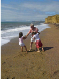
Adults: "Come on Grampy"

At Burton Bradstock ONLINE's Open Meeting on Tuesday 21st November 2006, the judges announced the winners of the Digital Photo Competition which had been running during 2006. The winning photos were: